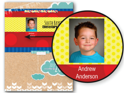
Ink Printing with Photo