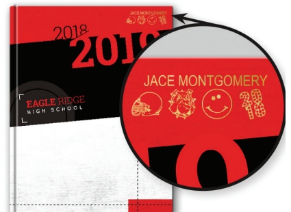
Foil Stamping with Icons